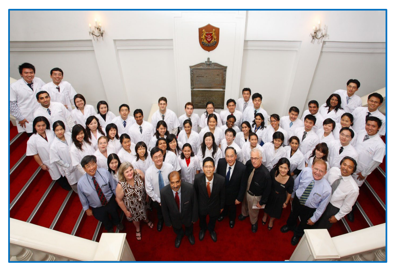
Blast from the Past! The photo above is from the White Coat Ceremony back in 2008. We pulled this photo from storage to celebrate the 10<sup>th</sup> Reunion for the Class of 2012 in September 2022.

We are so glad to be here in 2022 where it seems the pandemic's restrictions are coming to an end and as a result the Duke-NUS alumni social calendar has been filling up!