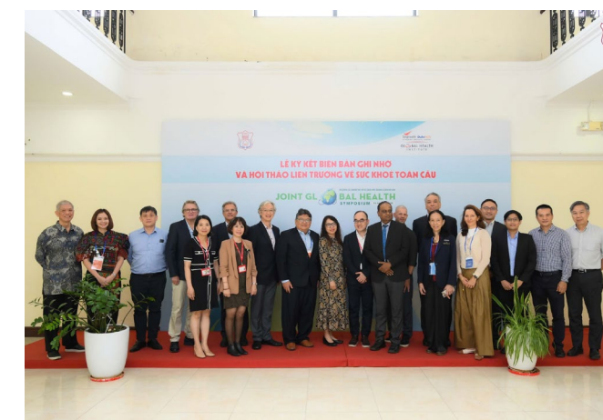
Partners from the Regional Collaborating Centres in Jaffna, Sri Lanka, and Medan, Indonesia coming together to celebrate the launch in Hanoi.